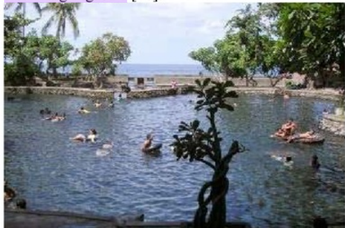
Figure 1: Air Sanih

The view of Air Sanih can be seen in the following Figure 1 [78].