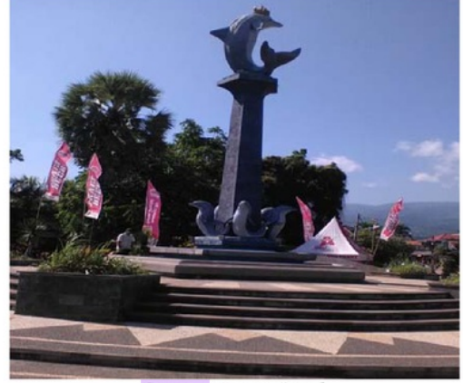
Figure 2: Lovina Beach

village. The display of Lovina Beach can be seen in the following Figure 2 [79].