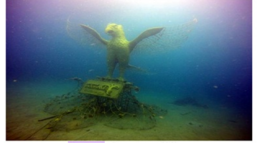
Figure 3: Pemuteran Village

The success of Pemuteran Village as the tourism destination has a positive contribution to the local economy. The outstanding role of local customs makes the space and location of the tourism destination comfortable and well-ordered. All problems are solved based on the approach of B cal customs. The display of Pemuteran Village can be seen in the following Figure 3 [80].