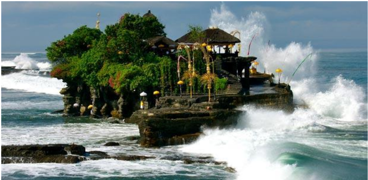
Figure 1. The natural atmosphere of Tanah Lot Temple

Wariga tump ritual is the symbolic ecological phenomenon. It believes that the world of macrocosm analogizes to the universe and its contents. The universe and its content are under the control of The Almighty God, and they should be preserved in harmony with the Hindu concept of Tri Hita Karana . This concept teaches Balinese Hindus to maintain a balanced and harmonious relationship, namely a harmonious relationship with (1) God, called parhyangan , with (2) fellow human beings called pawongan , and a harmonious relationship with (3) the environment called palemahan . The existence of all objects that are present in this nature, along with the entire ecosystem as well as the environment, are the proves of the power of God The Creator. According to the belief of the Balinese-Hindu community, that nature has magical powers as the God of the heavens, the Ruler of the earth, the Ruler of plants, the God of fertility, and so on. This magical power is worshipped through various ritual activities to protect the environment.