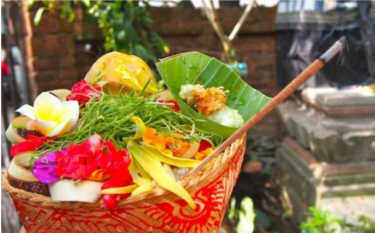
Fig. 4 Banten (Offering) Porridge for Wariga Tumpek Ritual

The action of offering is a kind of gratitude expression of Balinese-Hindu toward Ida Sanghyang Widhi Wasa , The Almighty God, for the gifts of plants for the welfare of humanity. The existence of Tumpek Wariga as a symbol of the balance of the universe and its contents are worth keeping and obeying. Balance is a prerequisite for harmony. It is expected to occur between all aspects of life. In this connection, every human being is expected to be able to position himself in a balanced and harmonious manner with the environment and position so that peace can be achieved. That is how the Balinese-Hindu community interpreted the celebration of Tumpek Wariga as a mirror to maintain balance and harmony in living with the natural environment.