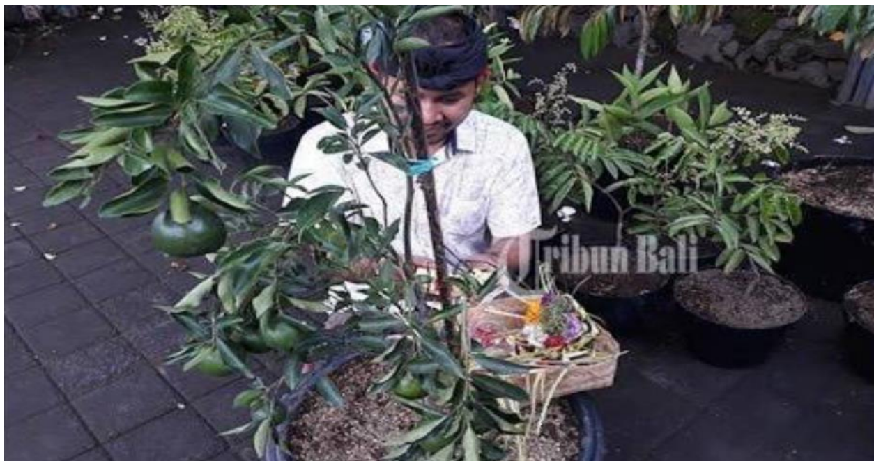
Fig. 5. Banten (Offerings) porridge on potted plants during the feast of the Tumpek Wariga

Even though the current condition faces difficulty because of the limited land for planting, and the absence of trees, especially in urban areas, Hindus Balinese people are still maintaining Tumpek Wariga ritual. They keep planting in the small pots, so the ritual of Tumpek Wariga can still be conducted.