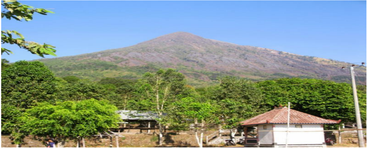
Fig. 2 The atmosphere of Mount Batur

That is why the Balinese-Hindu community is taught to respect, preserve, and develop various natural potentials. The teachings are contained in the teachings of Yajna ceremony. The ceremony is a sacred sacrifice with sincerity. Therefore, it is stated that the implementation of Tumpek Wariga ritual is a symbol of balance and harmony based on the belief of the Balinese-Hindu community. In accordance with the thoughts, Suarjaya (2010: 116) states that the universe is a unity that can animate all God's creations. It implies that humans and nature have a reciprocal relationship. Nature will not be able to proceed well without human assistance, and vice versa, humans cannot live without nature. Next, plants are realized as natural resources that are capable of providing materials of basic human needs such as food, shelter, and medicine, as well as as a source of family income. In addition, plants help humans preserve the environment such as preventing erosion, fertilizing the soil, and binding the soil.