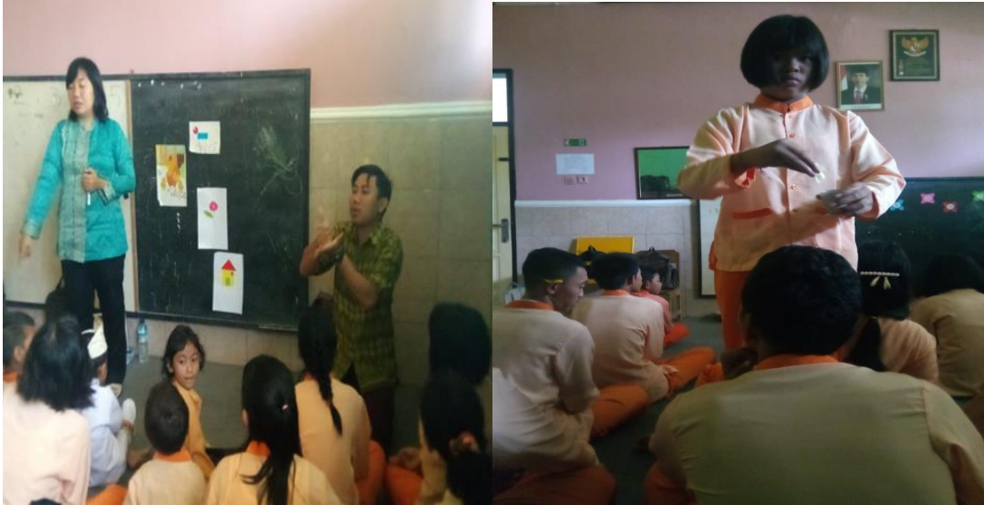
Figure 3. The synergy of religion teachers with disability teachers and Application of student confidence

The learning of Hindu values education on diffable student's concerns on their needs by enriching them with stories and pictures. Other factors that enrich their knowledge is the active participation of teachers and parents in the process developing a student's character (Titib, 2003). Their role contributes to learning their children's demands and take apart in the educational process of students with disabilities.