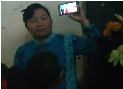
Figure 1. The teacher shows the media of images through a mobile phone

competency, 2) Deliver the material with image as introductory, This picture was also shown by a mobile phone (picture1), 3) Teachers show the activity of the images related to material and way of sitting while devout Puja Trisandhya , 4) Teachers call students consecutively to arrange pictures to be logically arranged, 5) Teachers give examples of basic act and show them to do the basic thinking of that picture's arrangement, 6) From the reasons/picture arrangement begin to use concept/material regarding the goal competency, 7) Conclusion/summary.